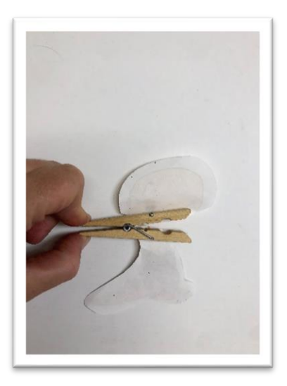
Glue top half of character on the top half of the clothespin. Match bottom half to top and glue the bottom half on to lower clothespin.