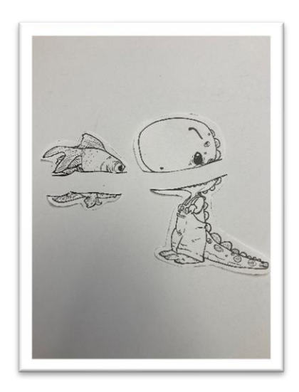
Cut along the line to separate the top and bottom half of each character's mouth.

Color Penelope and Walter then cut along outline of each character