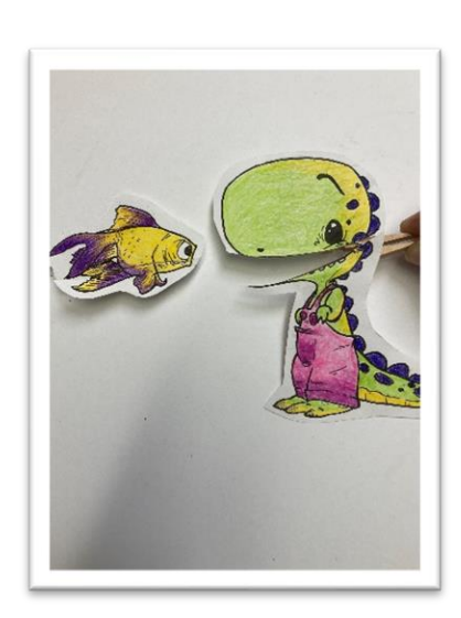
Play with your puppets! Act out the story for a younger sibling or loved one. What does your dinosaur sound like?